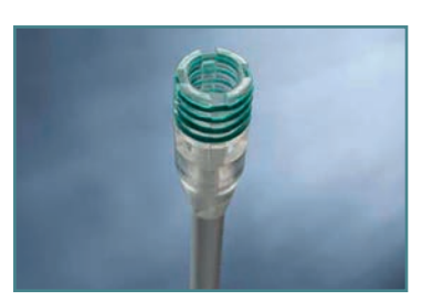
Step 3: When tissue is secured, press the trigger to its final position - this will release the band onto the targeted haemorrhoid.