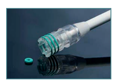
Step 4: Release! When the trigger is completely released a new band will be automatically reloaded and ready for the next band application.