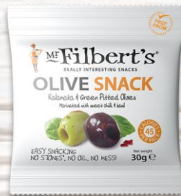
30g Kalamata & Green Olives with Chilli & Basil