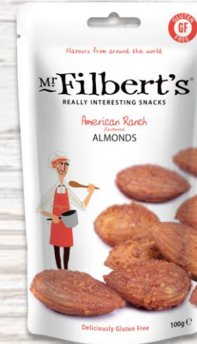
100g American Ranch spiced Almonds