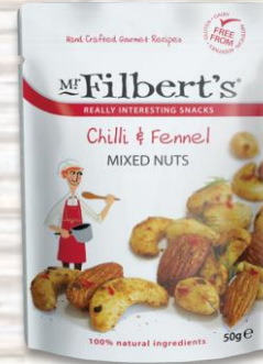
50g Chilli & Fennel Mixed Nuts