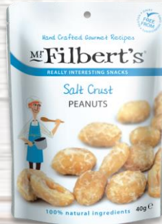
40g Salt Crust Peanuts