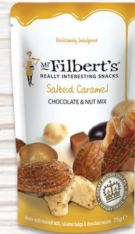
75g Salted Caramel Chocolate & Nut Mix