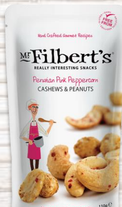
110g Peruvian Pink Peppercorn Cashews & Peanuts