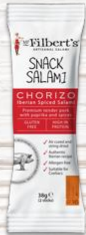
38g Chorizo (Spicy Paprika Salami)

Iberian pork, air cured and string tied to produce a high in protein salami snack [case size: 15 x 38g]