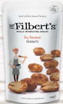
110g Dry Roasted Peanuts

Original recipes inspired by flavours from around the world [case size: 10]