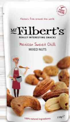
110g Mexican Sweet Chilli Mixed Nuts