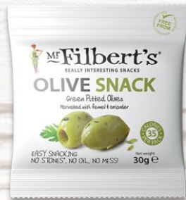
30g Green Olives with Fennel & Coriander

Authentic Greek recipes – No oil, No stones, No mess. [case size: 8 x 65g; 20 x 30g]