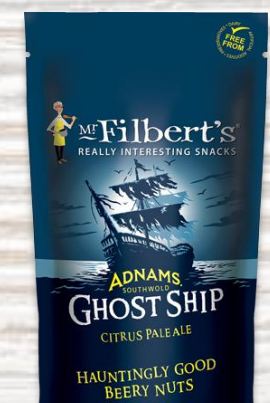
110g Adnams Ghost Ship Peanuts