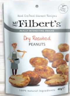
40g Dry Roasted Peanuts