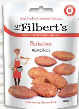
40g Barbecue spiced Almonds