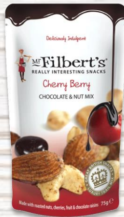
75g Cherry Berry Chocolate & Nut Mix

Premium Chocolate & Nut Mixes and Perfect Partnerships