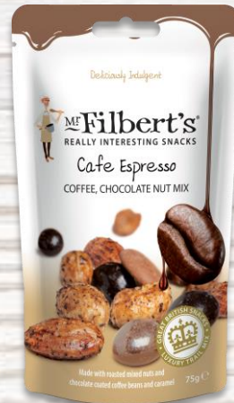
75g Café Espresso Chocolate & Nut Mix