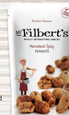
110g Marrakesh Spicy Peanuts