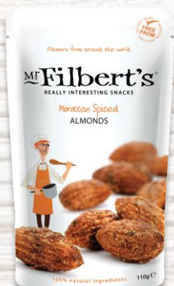
110g Moroccan Spiced Almonds