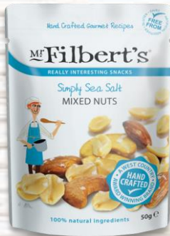
50g Simply Sea Salt Mixed Nuts