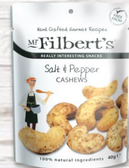
40g Salt & Pepper Cashews