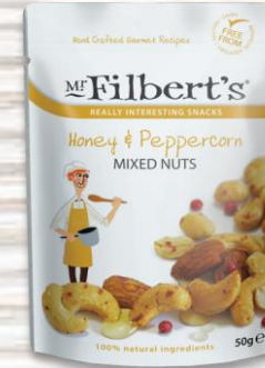
50g Honey & Peppercorn Mixed Nuts