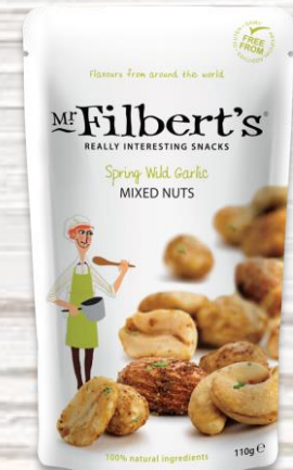
110g Spring Wild Garlic Mixed Nuts