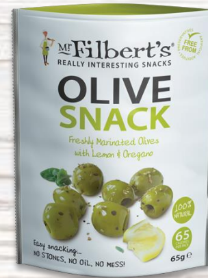
65g Halkidiki Green Olives with Lemon & Oregano