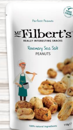
110g Rosemary Sea Salt Peanuts