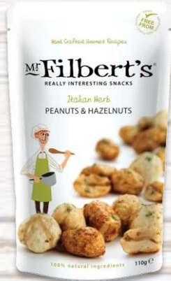
110g Italian Herb Peanuts & Hazelnuts