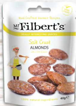
40g Salt Crust Almonds with a twist of lemon