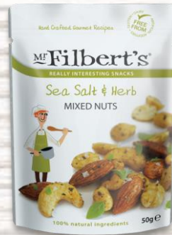
50g Sea Salt & Herb Mixed Nuts