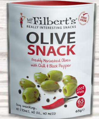
65g Halkidiki Green Olives with Chilli & Black Pepper