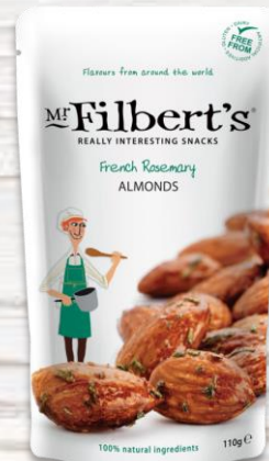
110g French Rosemary Almonds