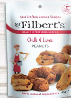
40g Chilli & Lime Peanuts