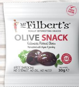
30g Kalamata Olives with Thyme & Basil