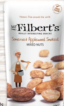
110g Somerset Applewood Smoked Mixed Nuts