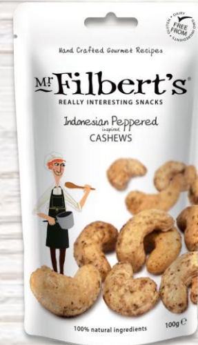
100g Indonesian Pepper Inspired Cashews