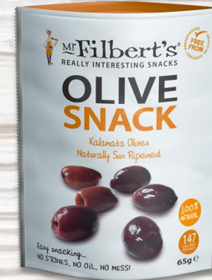
65g Kalamata Olives