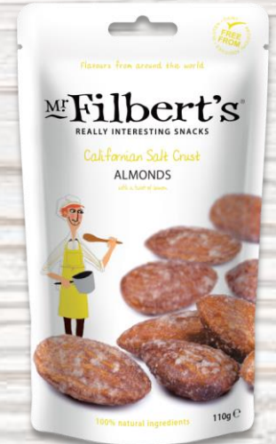
110g Californian Salt Crust Almonds with a twist of lemon