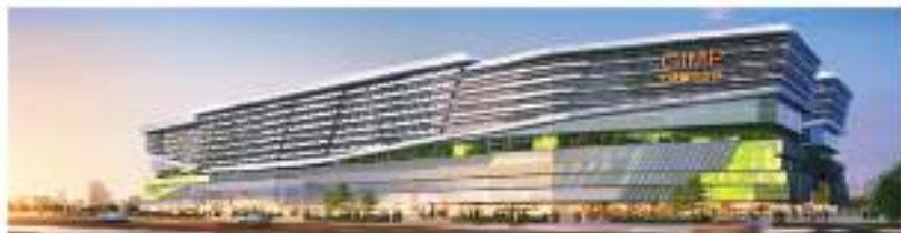
广州国际医药港 (Medical Mall) 医疗港

广州国际医药港，是经国家食品药品监督管理局批准注册的中国现代大型医药物流综合项目，是广东省“十三五”规划重点项目，由中信自和兴头企业立立集团投资建设并运营。