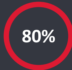
Franchise Sales Contribution