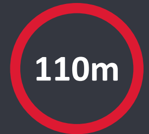
Total International Turnover