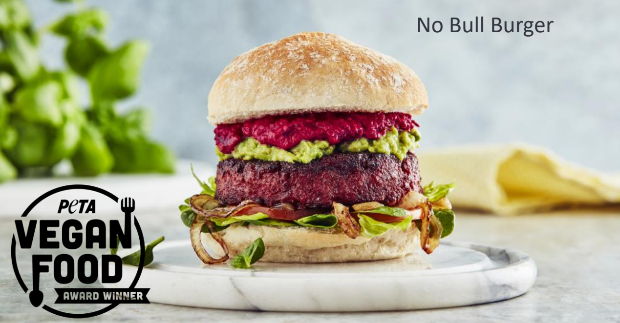
No Bull Burger