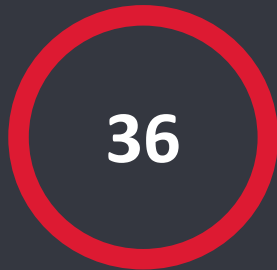
International Iceland Stores