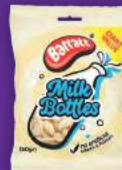
MILK BOTTLES 6 x 190g