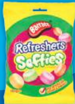
REFRESHERS SOFTIES 8 x 160g, 12 x 120g