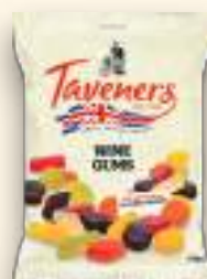
WINE GUMS 12 x 1kg