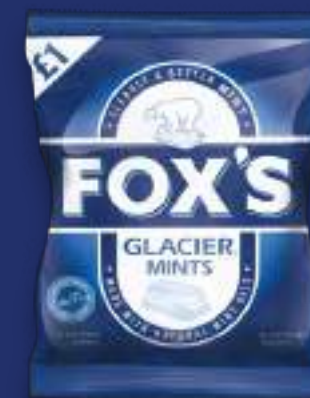
GLACIER MINTS 12 x 130g