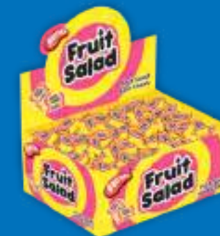
FRUIT SALAD 400pc