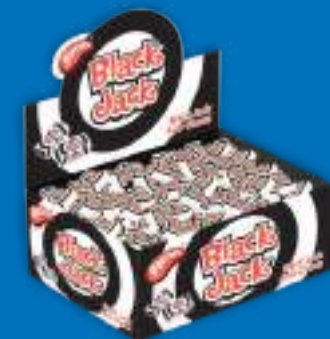
BLACK JACK 400pc