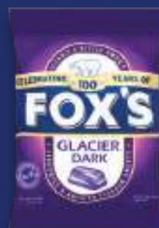
GLACIER DARK 12 x 200g