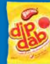
DIP DAB ORIGINAL 50 x 23g

A throwback to everyone's childhood, our Kids' Singles are a selection of retro sweets that are made with natural colours and flavours and are now a part of the Barratt family.