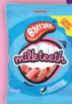
MILK TEETH 10 x 190g