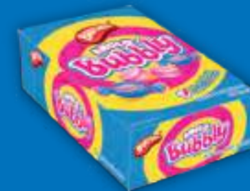
ANGLO BUBBLY 240pc