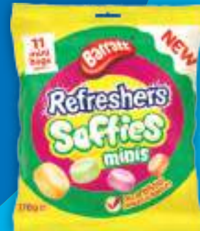
REFRESHERS SOFTIES BAG OF BAGS 14 x 176g