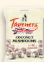
COCONUT MUSHROOMS 12 x 120g