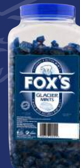
GLACIER MINTS Jar 2.34kg