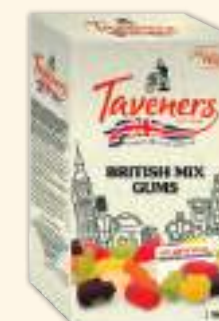
BRITISH MIX GUMS 6 x 700g