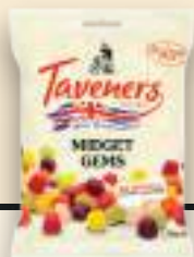
MIDGET GEMS 12 x 165g