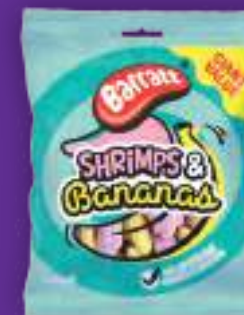
SHRIMPS & BANANAS 10 x 220g