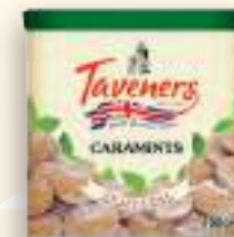
CARAMINTS 24 x 200g