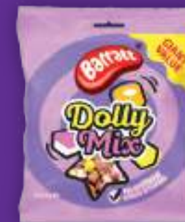
DOLLY MIX 12 x 230g