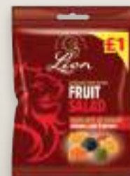
FRUIT SALAD 12 x 150g