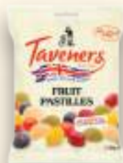
FRUIT PASTILLES 12 x 165g