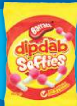
DIP DAB SOFTIES 8 x 160g, 12 x 120g