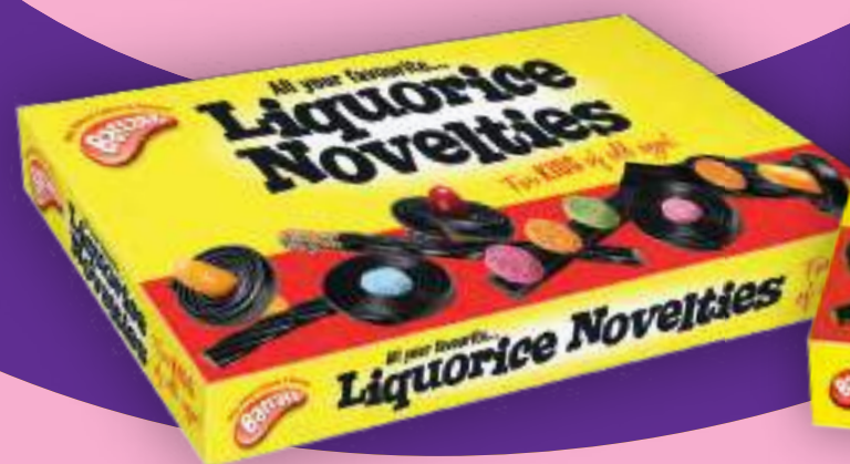
LIQUORICE NOVELTIES 16 x 270g, 6 x 270g

Since 1848 Barratt has been the home of many of your favourite retro, iconic sweets. Creating fun, wonder and excitement and making sweet memories for treat lovers of all ages.