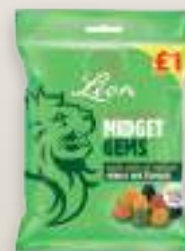
MIDGET GEMS 12 x 150g