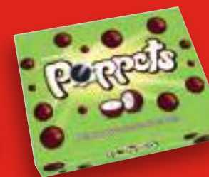
MINT 154g / 175g