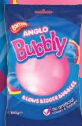
ANGLO BUBBLY 12 x 180g