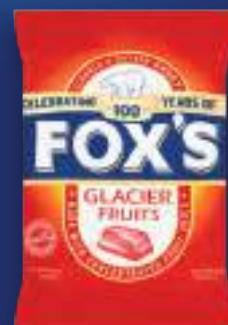
GLACIER FRUITS 12 x 200g, 10 x 200g