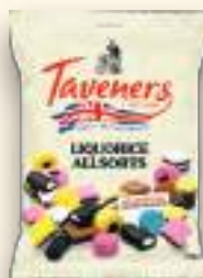
LIQUORICE ALLSORTS 12 x 1kg