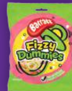
FIZZY DUMMIES 7 x 200g