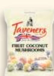
FRUIT COCONUT MUSHROOMS 12 x 120g