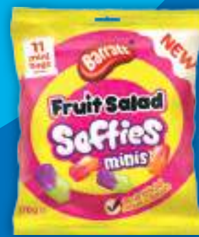
FRUIT SALAD SOFTIES BAG OF BAGS 14 x 176g