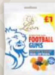
FOOTBALL GUMS 12 x 150g