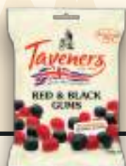
RED & BLACK GUMS 12 x 165g