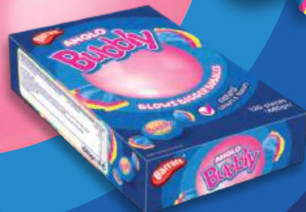
ANGLO BUBBLY 9 x 120pc