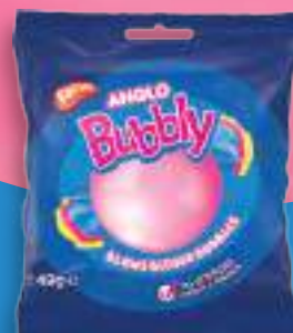
ANGLO BUBBLY 18 x 49g