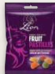
FRUIT PASTILLES 20 x 190g