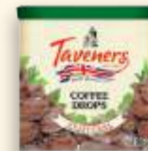
COFFEE DROPS 24 x 200g