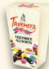
LIQUORICE ALLSORTS 12 x 400g