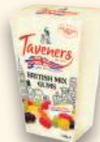
BRITISH MIX GUMS 12 x 400g