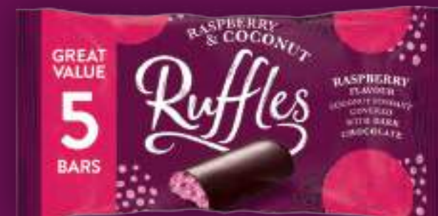
RASPBERRY RUFFLES BARS 14 x 130g Bar Multipack