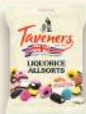
LIQUORICE ALLSORTS 12 x 165g