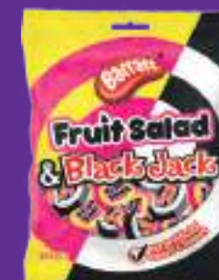
FRUIT SALAD & BLACK JACK 11 x 185g