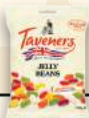
JELLY BEANS 12 x 165g