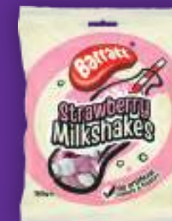
STRAWBERRY MILKSHAKES 11 x 180g