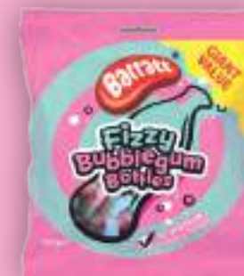
BUBBLEGUM BOTTLES 8 x 210g