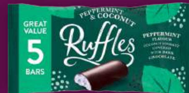
PEPPERMINT RUFFLES BARS 14 x 130g Bar Multipack