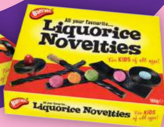
LIQUORICE NOVELTIES 6 x 180g