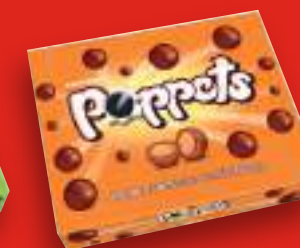
ORANGE 154g / 175g