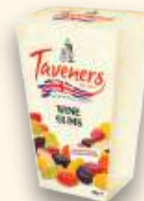
WINE GUMS 12 x 400g