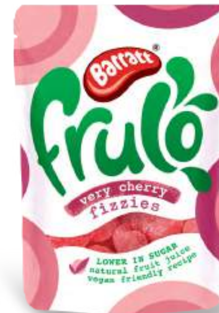
VERY CHERRY FIZZIES 8 x 125g