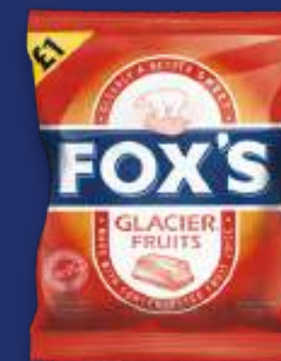
GLACIER FRUITS 12 x 130g