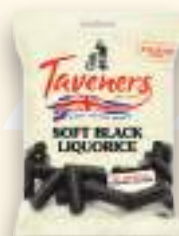
BLACK SEL 12 x 165g