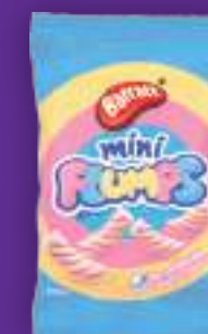
MINI FLUMPS 19 x 150g