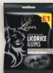
LICORICE GUMS 12 x 150g