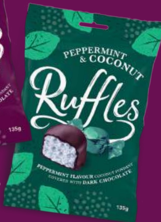
PEPPERMINT RUFFLES BAG 6 x 135g 12 x 135g SRP 24 x 135g plain brown outer