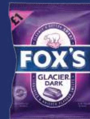
GLACIER DARK 12 x 130g