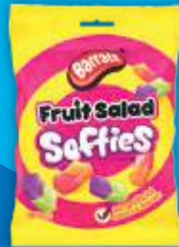
FRUIT SALAD SOFTIES 8 x 160g, 12 x 120g

Part of the Barratt family, the Fruit Salad, Refreshers and Dip Dab Softies range of retro sweets are made with natural colours & flavours and now includes some exciting new mini additions.