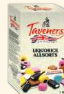
LIQUORICE ALLSORTS 6 x 700g