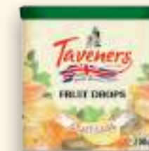
FRUIT DROPS 24 x 200g