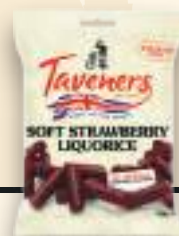
RED SEL 12 x 165g