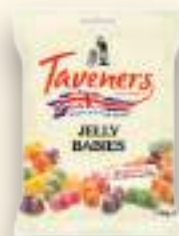
JELLY BABIES 12 x 165g