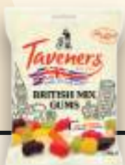
BRITISH MIX GUMS 12 x 165g