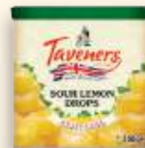
SOUR LEMON DROPS 24 x 200g