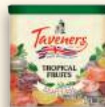
TROPICAL FRUITS 24 x 200g