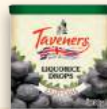
LIQUORICE DROPS 24 x 200g

Taverners tins supplied by A L Simpkin & Co Ltd