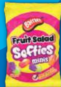
FRUIT SALAD SOFTIES MINIS 24 x 30g