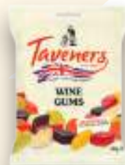
WINE GUMS 12 x 165g