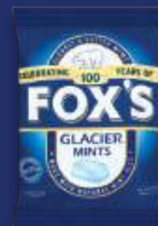
GLACIER MINTS 12 x 200g, 10 x 200g