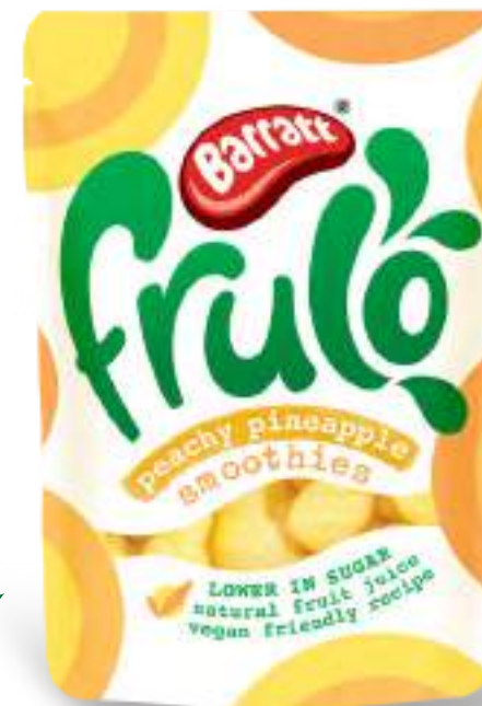
PEACHY PINEAPPLE SMOOTHIES 8 x 125g

Incredibly juicy and mouth-wateringly moreish, it's all the flavour with a little less guilt.