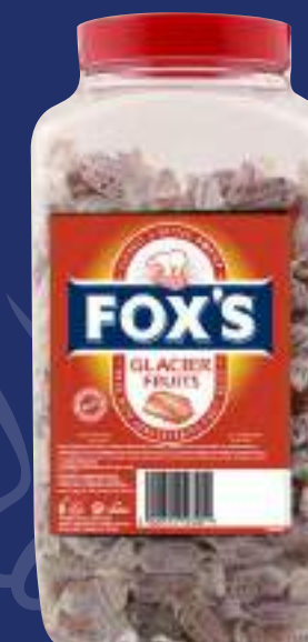
GLACIER FRUITS Jar 2.34kg