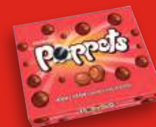
TOFFEE 154g / 175g