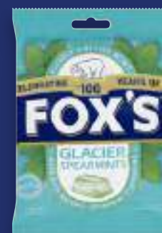
GLACIER SPEARMINTS 12 x 200g