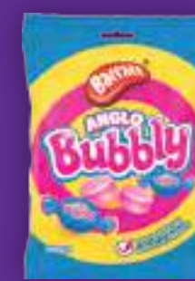
ANGLO BUBBLY 28 x 180g