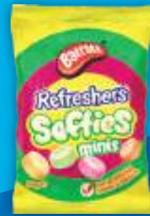
REFRESHERS SOFTIES MINIS 24 x 30g