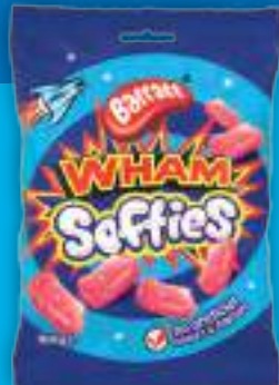
WHAM SOFTIES 8 x 160g, 12 x 120g