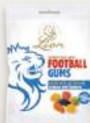
FOOTBALL GUMS 20 x 190g