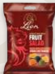
FRUIT SALAD 20 x 190g

Sweets may come and go but nothing beats the timeless appeal of great tasting Lion gums.