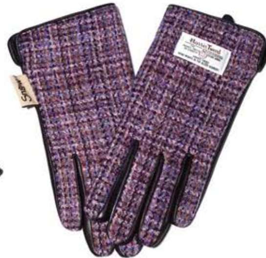
Violet Mini Dogtooth