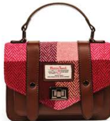
Fuchsia Leather Edition