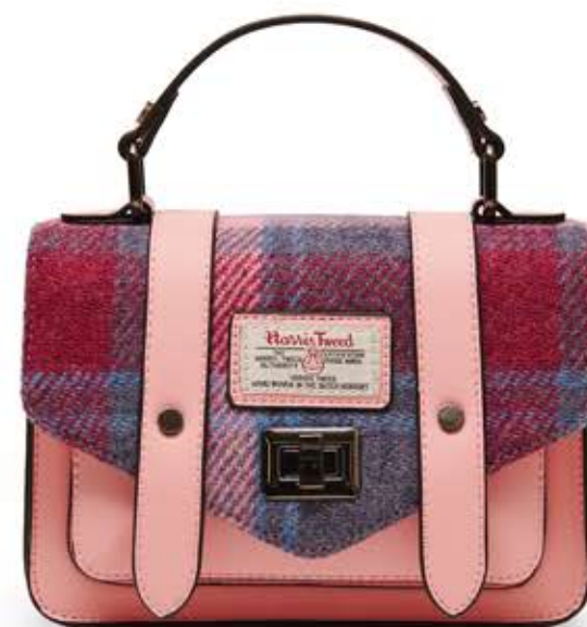
Pink & Blue