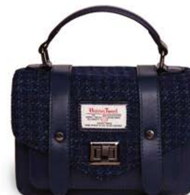
Navy Leather Edition