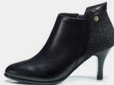
Black Leather - WS £58.00 RRP £145.00