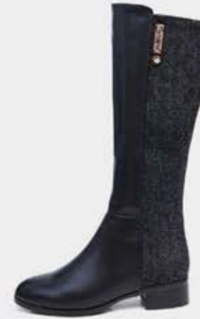
Black Leather - WS £88.00 RRP £219.00